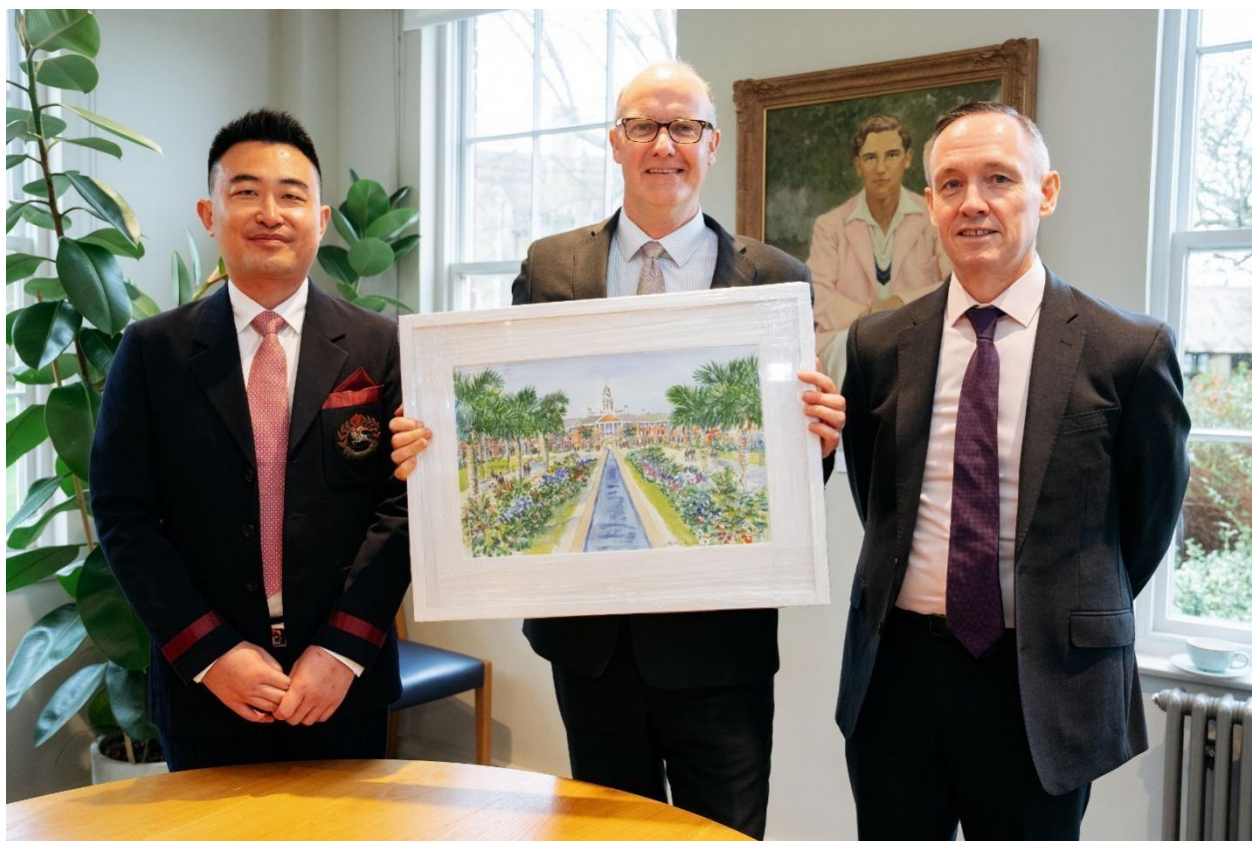
Official signing of the Charterhouse Lagos Agreement at Charterhouse UK